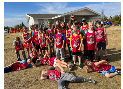
Cross Country Running